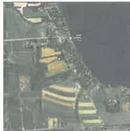
LOCATION MAP SIT 10-W-LAKE